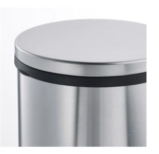
Specifications: Stainless steel round foot 5 liters