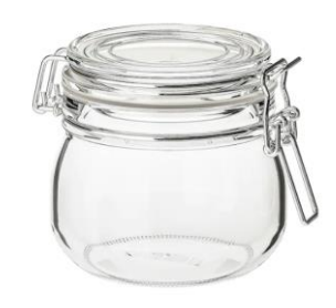
17 OZ (3pcs)