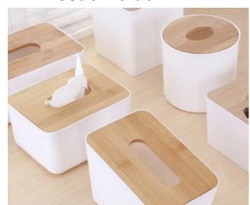
Round (2pcs) Rectangular (1pc)